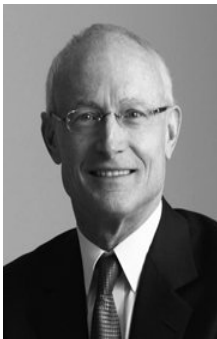
Michael E. Porter, Ph.D., age 65, Nominee for Election as a Director of the Company

Committee Memberships: Finance; Innovation & Technology (Chair)