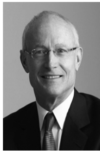
Michael E. Porter, Ph.D., age 65, Nominee for Election as a Director of the Company

Committee Memberships: Finance; Innovation & Technology (Chair)