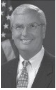
Stephen L. Johnson, age 61, Director of the Company since 2010

Mr. Johnson is the President and Chief Executive Officer of Stephen L. Johnson and Associates Strategic Consulting, LLC (“Johnson and Associates”), a strategic provider of business, research and financial management and consulting services formed in 2009. Prior to forming Johnson and Associates, Mr. Johnson worked for the U.S. Environmental Protection Agency for 30 years, where he became the first career employee and scientist to serve as Administrator, a position he held from January 2005 through January 2009. Mr. Johnson serves as a director of M2 Renewables, Inc. and as a Trustee of Taylor University.