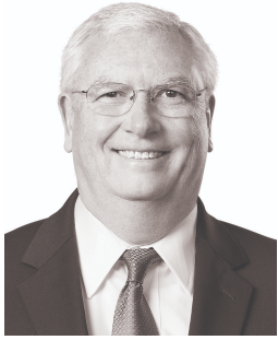
Stephen L. Johnson, age 66, Director of the Company since 2010

Mr. Johnson is the President and Chief Executive Officer of Stephen L. Johnson and Associates Strategic Consulting, LLC (“Johnson and Associates”), a strategic provider of business, research and financial management and consulting services formed in 2009. Prior to forming Johnson and Associates, Mr. Johnson worked for the U.S. Environmental Protection Agency for 30 years, where he became the first career employee and scientist to serve as Administrator, a position he held from January 2005 through January 2009. Mr. Johnson serves as a Director of Frederick Memorial Hospital and a Trustee of Taylor University.